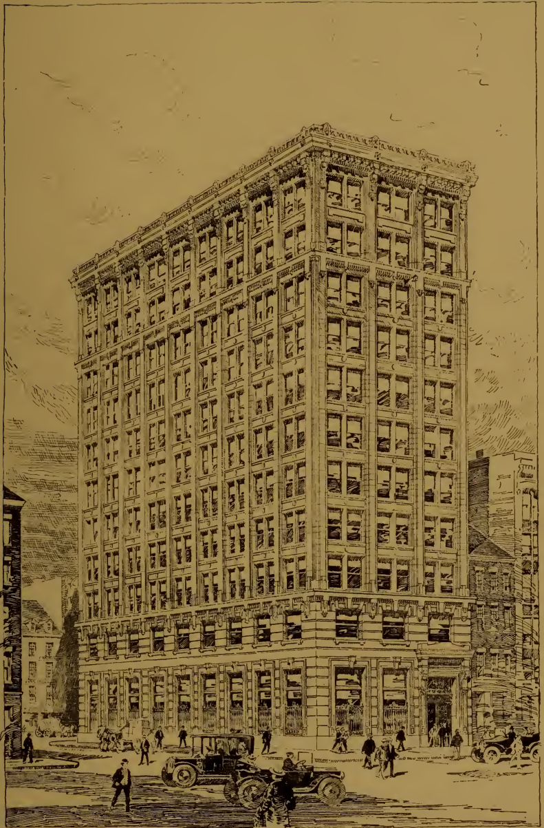
New Fidelity Trust Company Building to be built on Site of Crown Coffee House